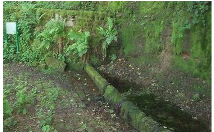
Thornhill town wells

We and the County Council try jointly to ensure that these bins are refilled as necessary, but this can become difficult to achieve promptly in sustained bad weather. If you find an empty grit-bin, please tell us ( clerk@bamfordwiththornhill-pc.gov.uk ) or tell DCC via http://www.derbyshire.gov.uk/gritbin Thanks!