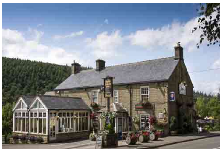
Yorkshire Bridge Inn

A mobile fishmonger visits once weekly, stopping on Taggs Knoll. And, on the 1 st & 3 rd Saturdays of each month, https://www.refillsontheroad.com mobile shop is at Bamford Institute from 10am to 1pm.