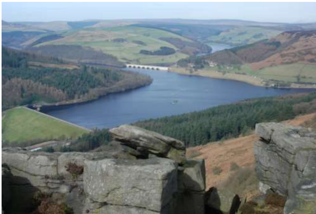
Ladybower reservoir from Bamford Edge