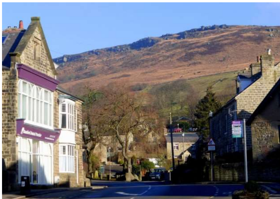
Bamford Edge above the village, with the dental practice at left and the village green beyond

The Borough Council's household bin-emptying is on an alternate-week cycle. The brown bin, green-lidded bin and red bag are emptied one week and the black bin the following week. Here are the bin-emptying dates for each street .