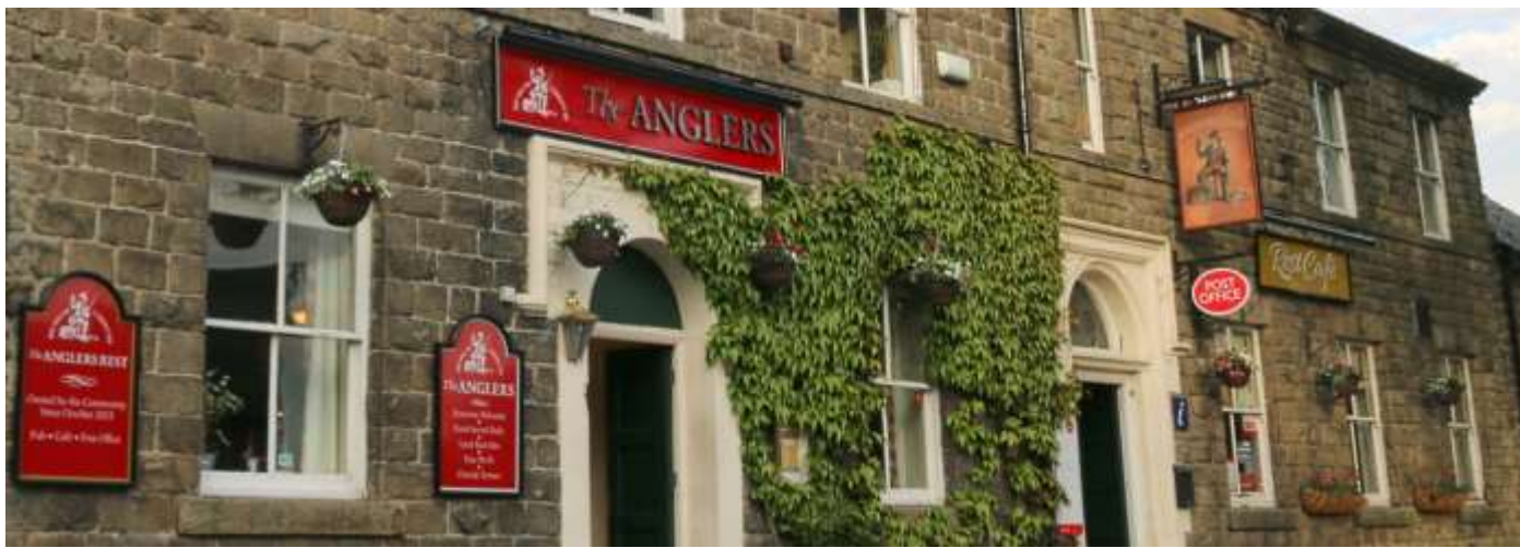
The Anglers Rest

The following local businesses would be very pleased of your custom.